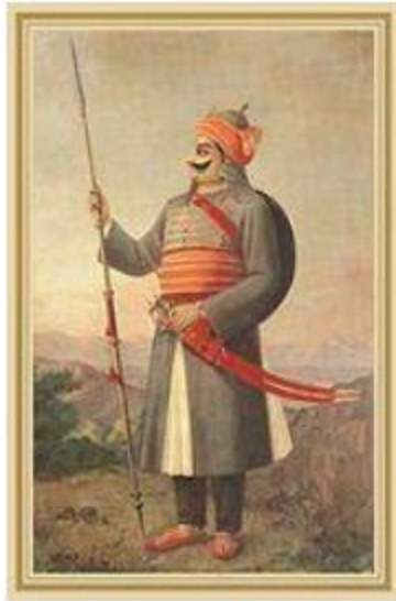
Rajputs emerged as a prominent community in the early medieval period