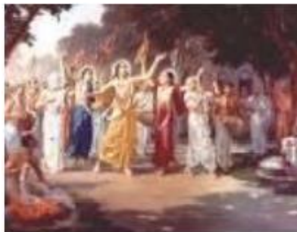
The Bhakti movement stressed on devotion to God without the interference of the Brahmins